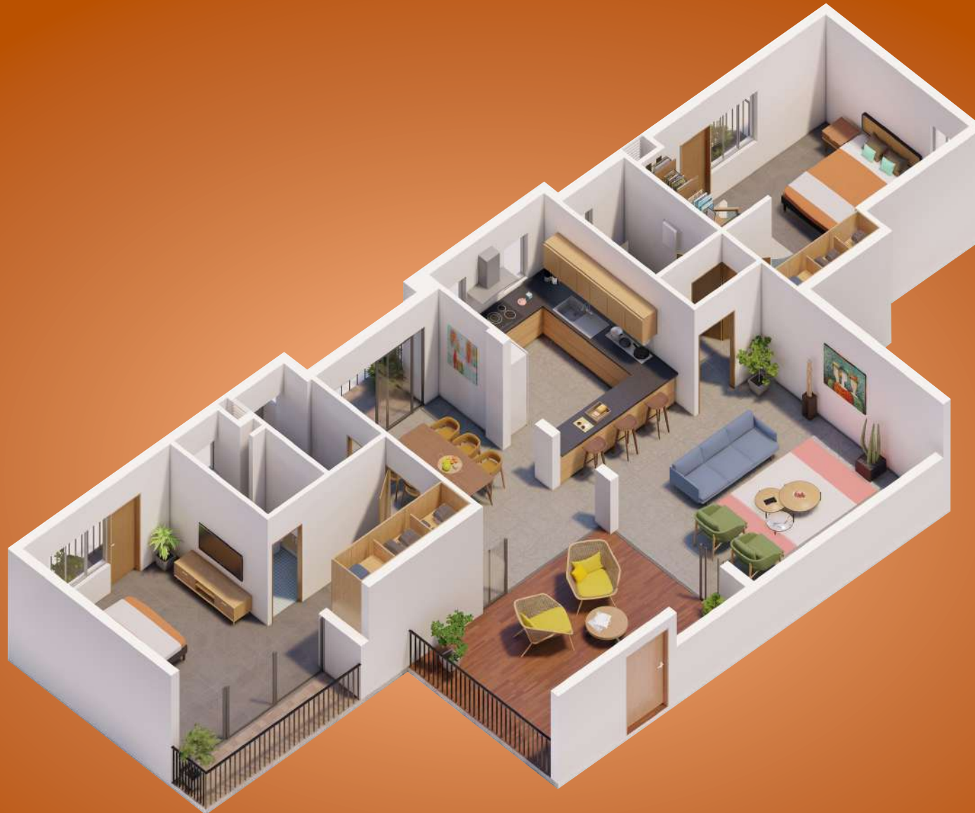
FIRST FLOOR 2-3 BHK - APARTMENT - F1 2272 Sft