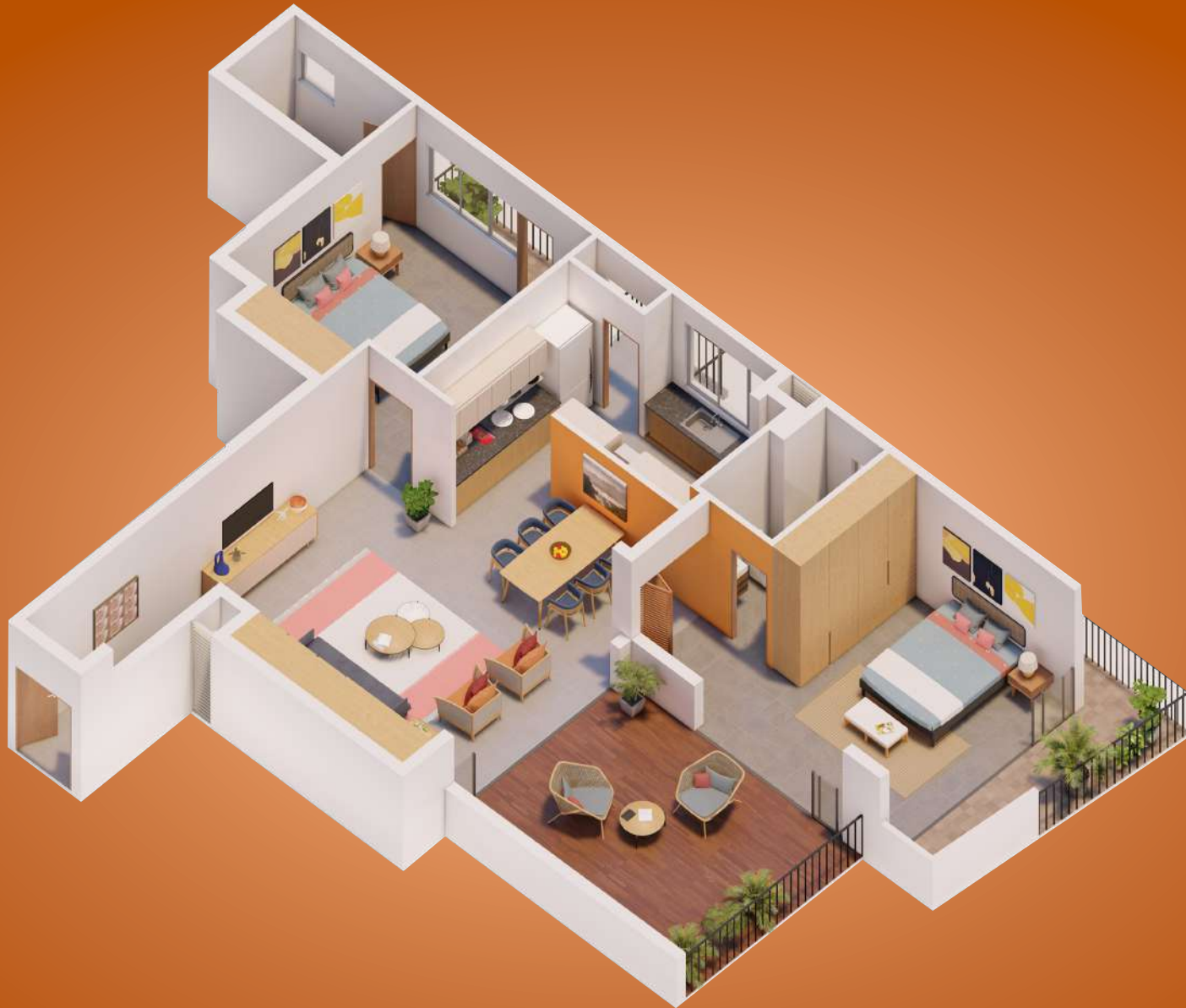
FIRST FLOOR 2 BHK - APARTMENT - F2 1669 Sft