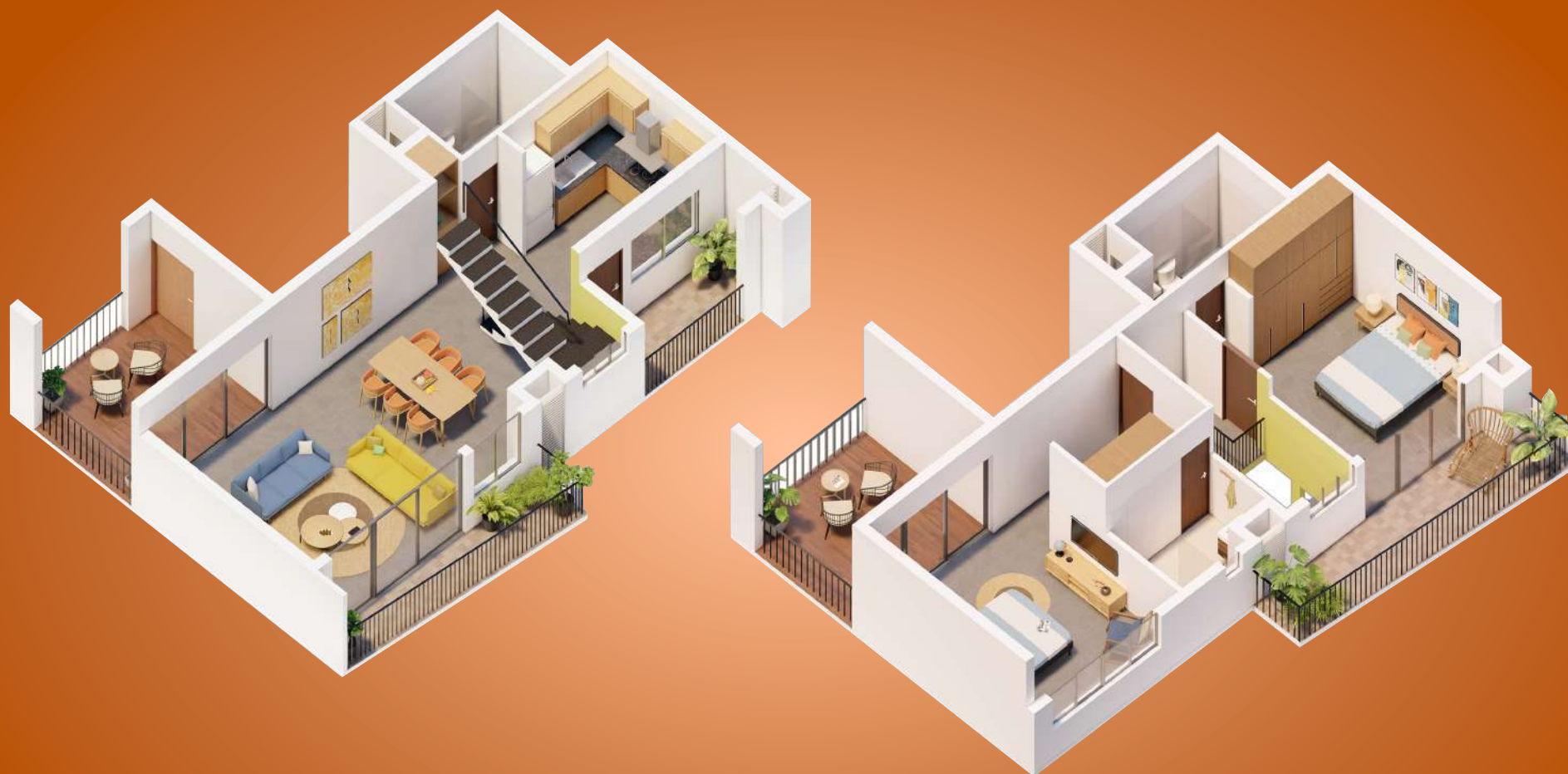
GROUND / FIRST DUPLEX 2-3 BHK - APARTMENT - G2 2030 Sft